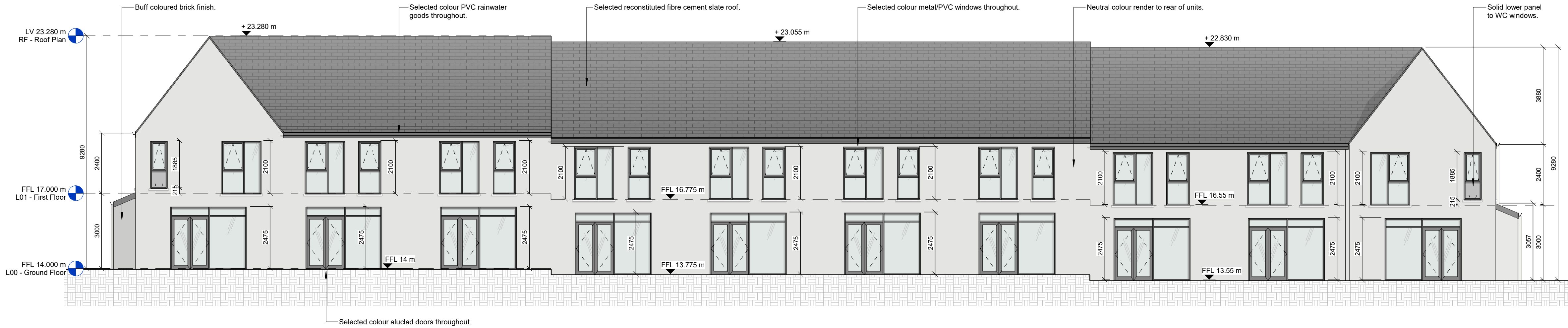
Rear Elevation 1 : 100