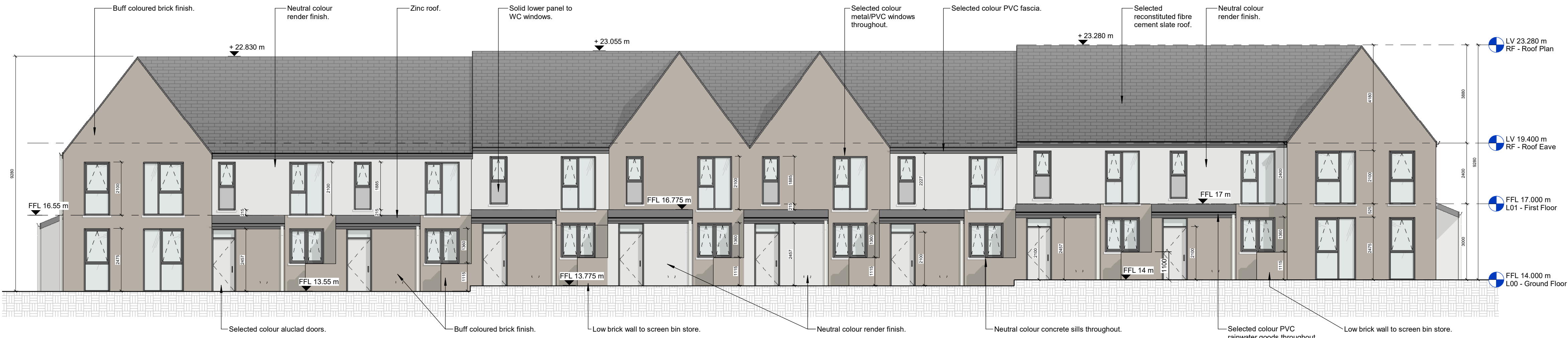
Front Elevation 1 : 100